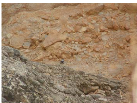
Wallcreeper at Riglos - by Elliott Staley