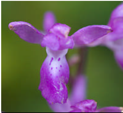
Lange's Orchid Orchis langei