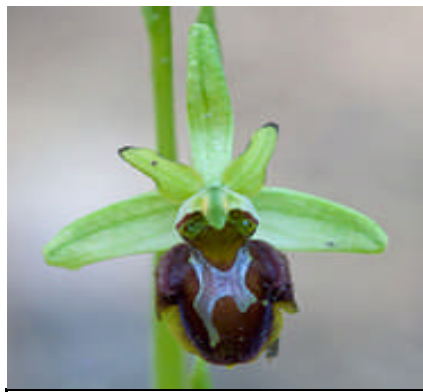
Early Spider Ophrys Ophrys sphegodes