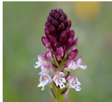
Burnt Orchid Orchis ustulata