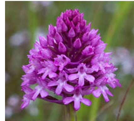
Pyramidal Orchid Anacamptis pyramidalis