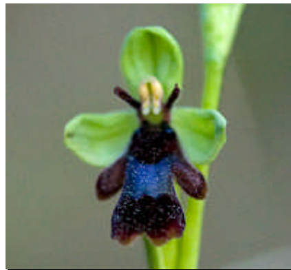
Fly Orchid Ophrys insectifera