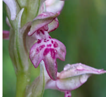
Bug Orchid Orchis coriophora