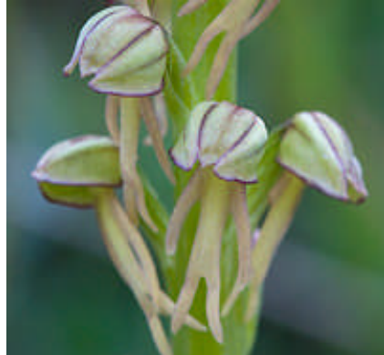
Man Orchid Aceras anthropophorum