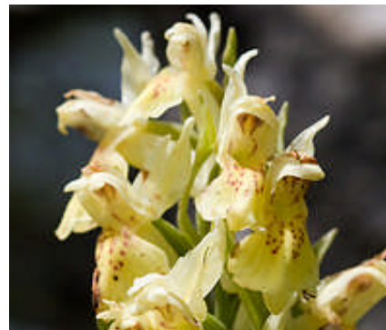
Elder-Flowered Orchid Dactylorhiza sambucina