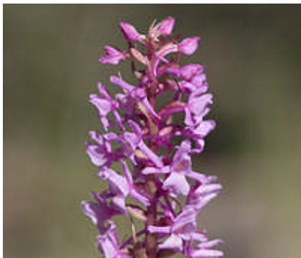
Fragrant Orchid Gymnadenia conopsea