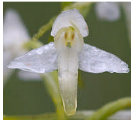
Lesser Butterfly Orchid Platanthera bifolia