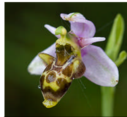
Woodcock Ophrys Ophrys scolopax apiformis