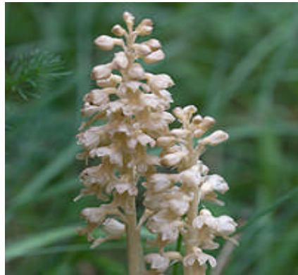
Bird's Nest Orchid Neottia nidus-avis