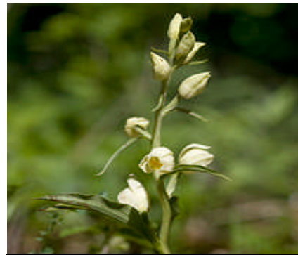
Large White Helleborine Cephalanthera damasonium