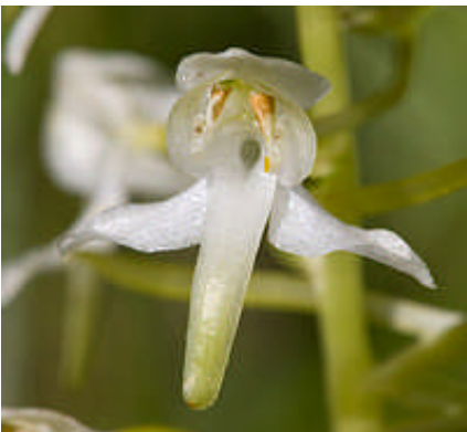
Greater Butterfly Orchid Platanthera chlorantha