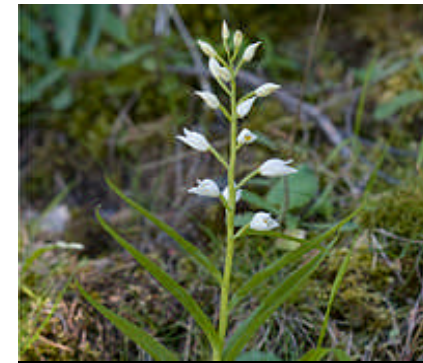
Sword-Leaved Helleborine Cephalanthera longifolia