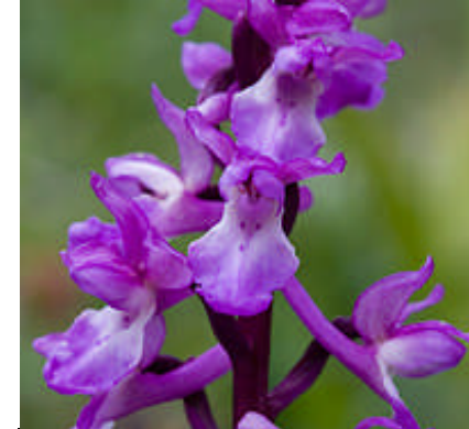
Early Purple Orchid Orchis mascula