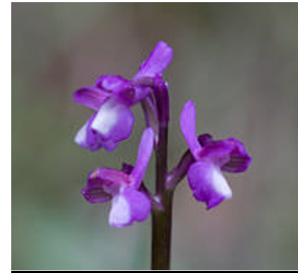
Champagne Orchid Orchis champagneuxii