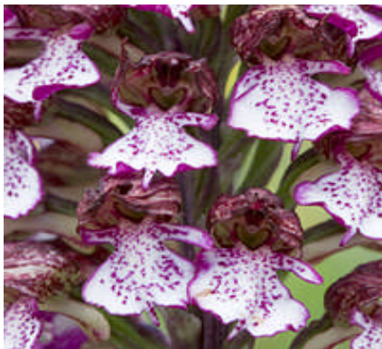
Lady Orchid Orchis purpurea