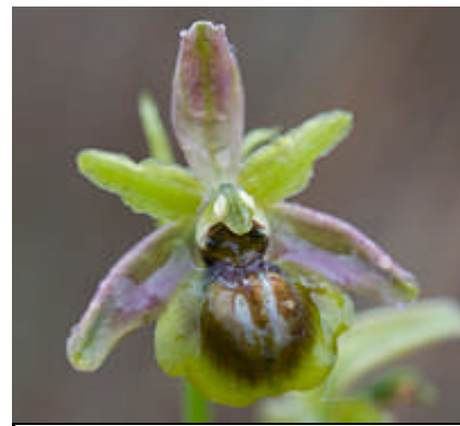
Small Spider Orchid Ophrys araneola riojana