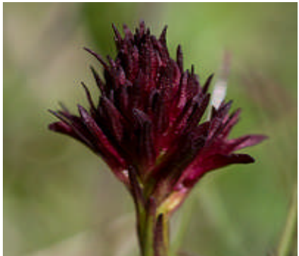
Vanilla Orchid Nigritella nigra