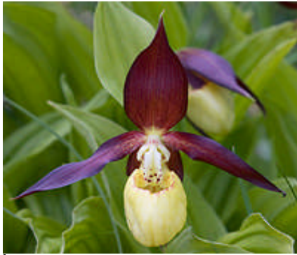
Lady's Slipper Cypripedium calceolus