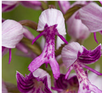
Military Orchid Orchis militaris