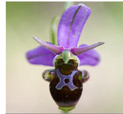
Woodcock Ophrys Ophrys scolopax scolopax