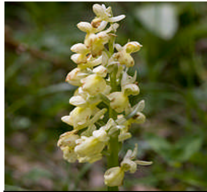
Pale-Flowered Orchid Orchis pallens