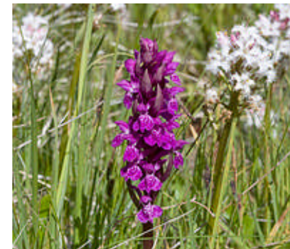
Broad-Leaved Marsh Orchid Dactylorhiza majalis