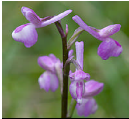
Green-Winged Orchid Orchis morio