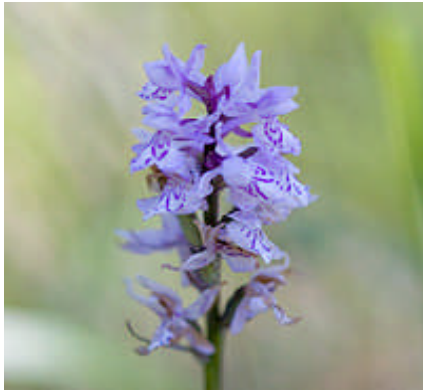
Common-spotted Orchid Dactylorhiza fuchsii