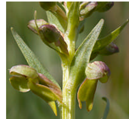
Frog Orchid Coeloglossum viride