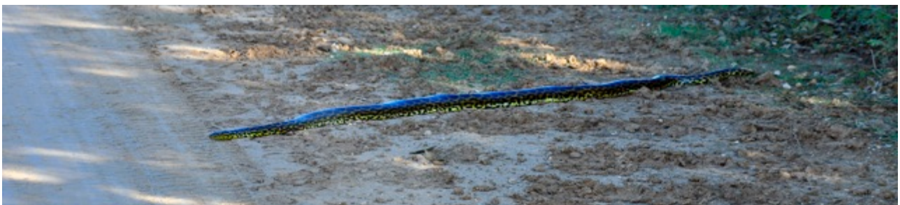
Pictures: Green Anaconda, Capybara, Jaguar, Harpy Eagle, Agami Heron, Giant Otter and Black Hooded Parakeet