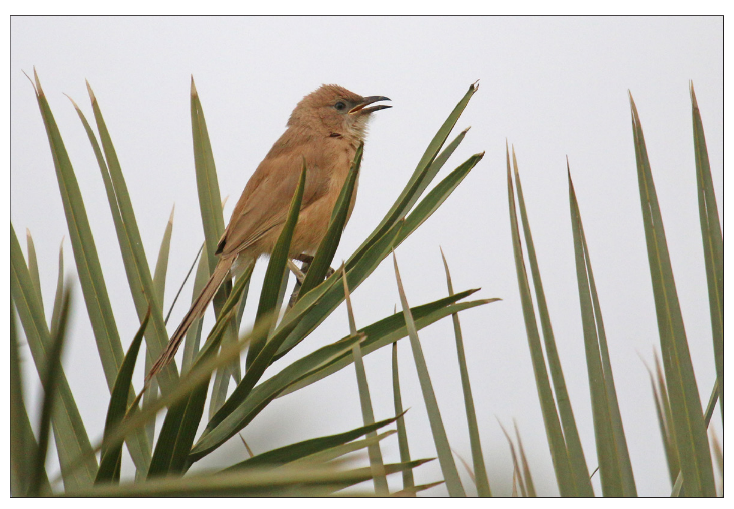
Fulvous Babber