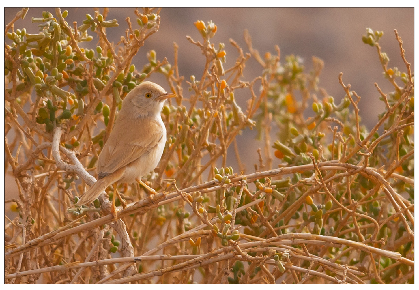
African Desert Warbler by Chris Poole