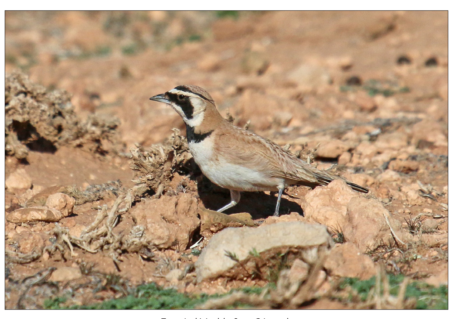
Temminck's Lark