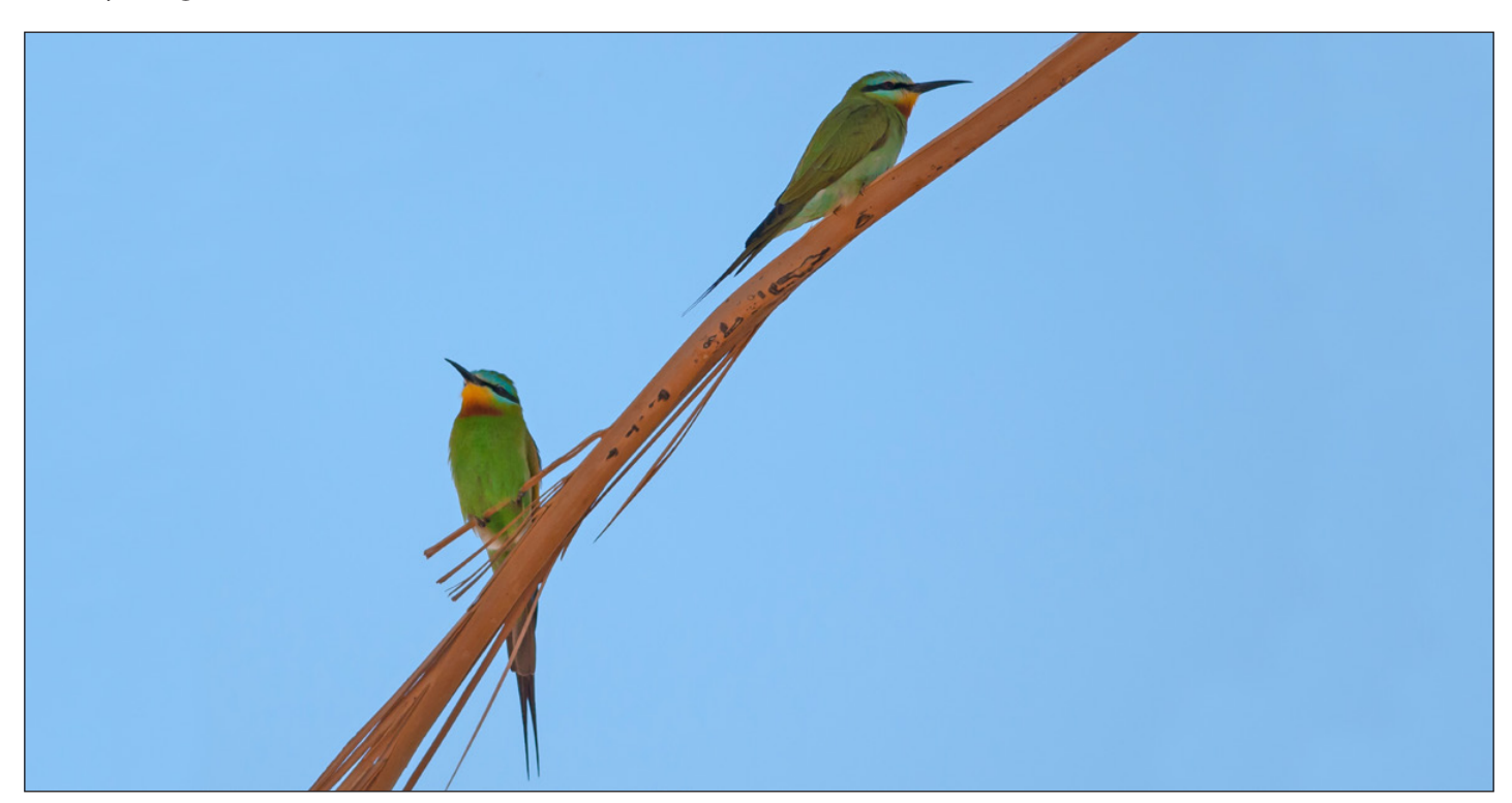
Blue-cheeked Bee-eaters by Chris Poole

A bit more searching produced four BLUE-CHEEKED BEE-EATERS several of which looked absolutely amazing as they caught VAGRANT EMPEROR DRAGONFLIES overhead.