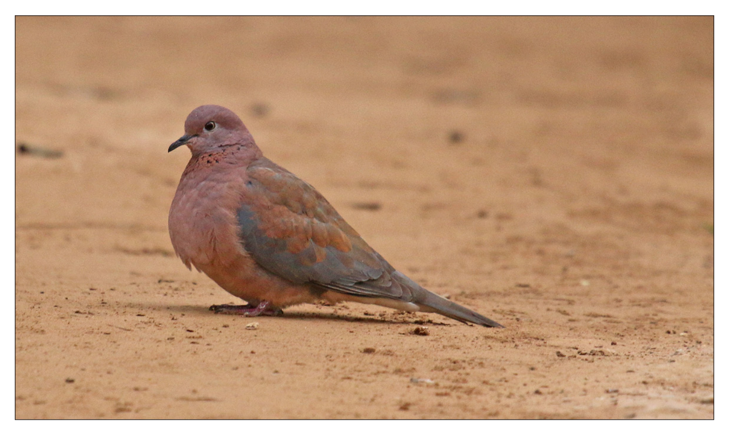
Laughing Dove