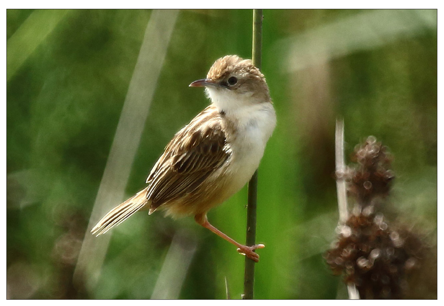
Zitting Cisticola by Peter Hobbs