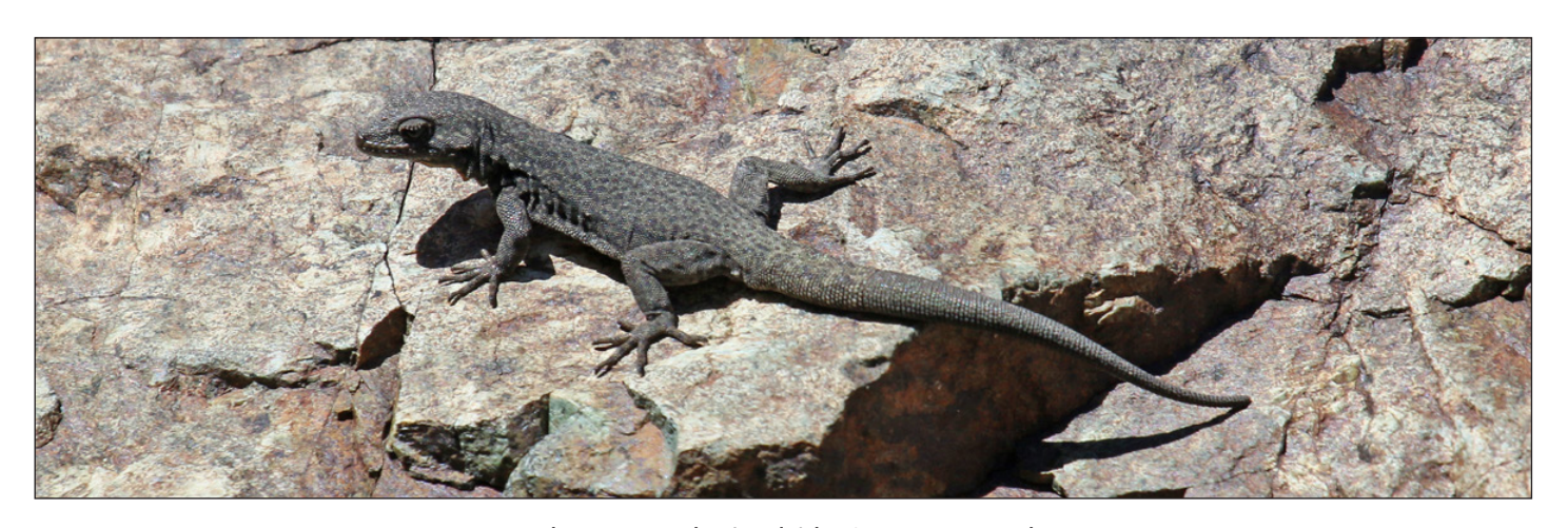
Atlas Day Gecko (male) by Steve Grimwade