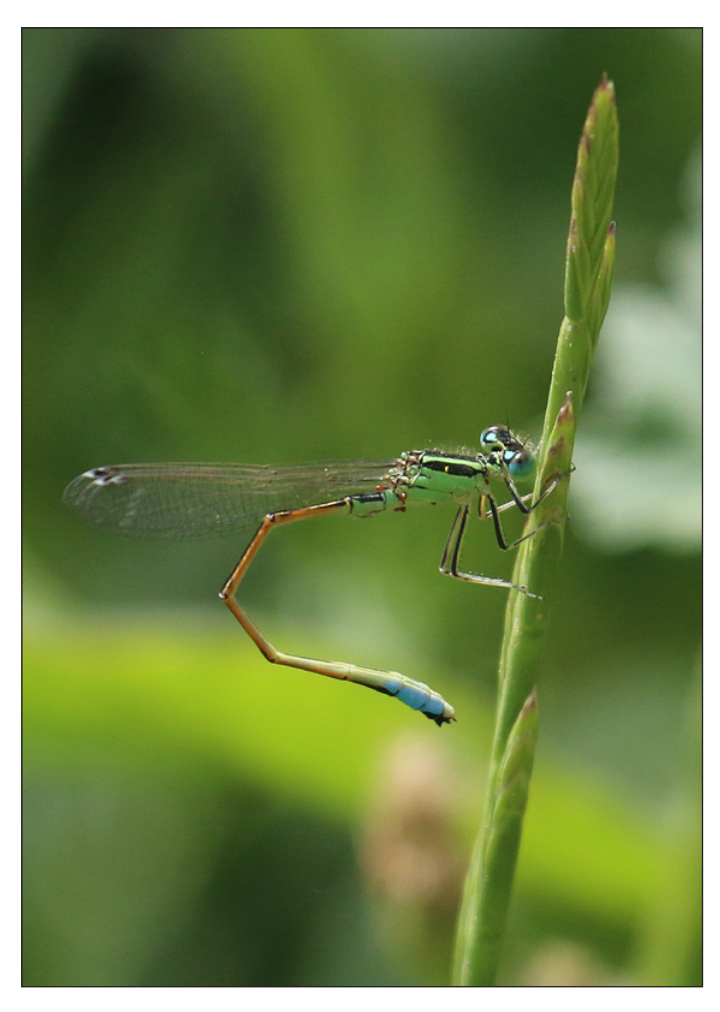
Sahara Bluetail