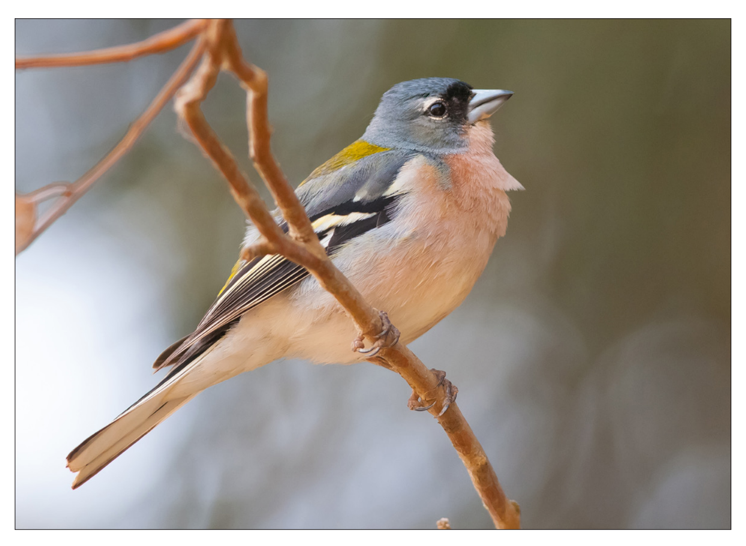
'African' Chaffinch by Chris Poole

It wasn't just raptors though with a male 'AFRICAN' CHAFFINCH showing well and in a small pine tree closeby we had stunning views of two RED CROSSBILLS.