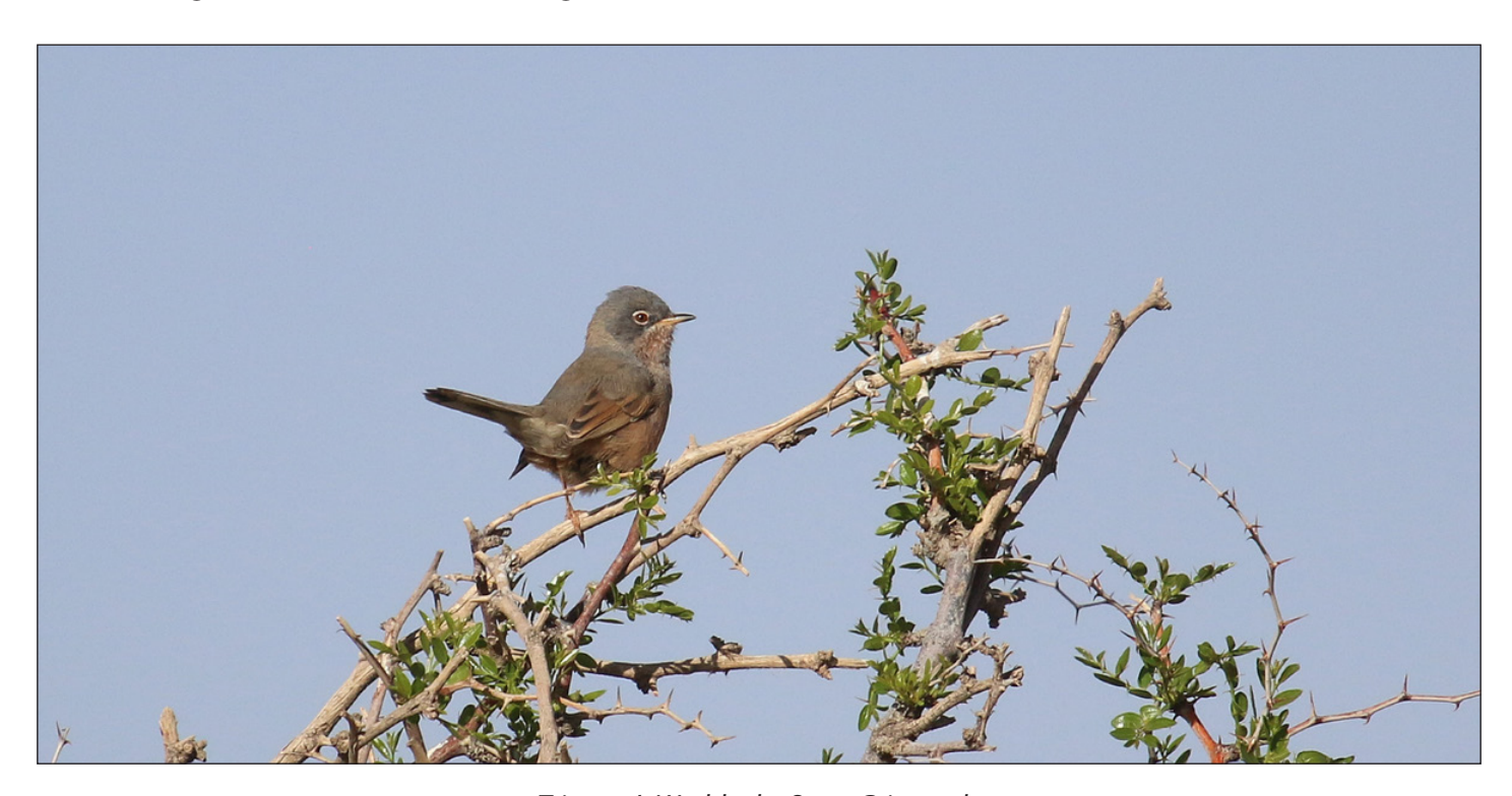
Tristram's Warbler

Our evening meal was delicious with again, so much choice.