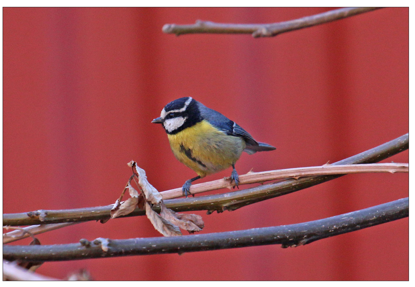
African Blue Tit by Steve Grimwade