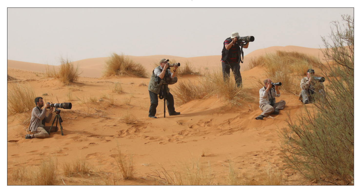
Photographing Western Bonelli's Warblers by Steve Grimwade