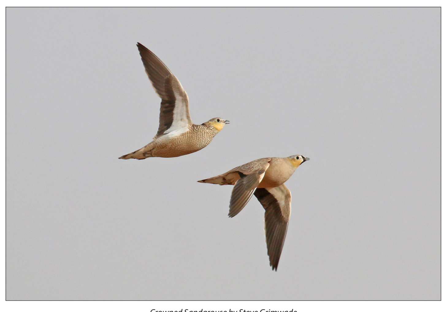
Crowned Sandgrouse