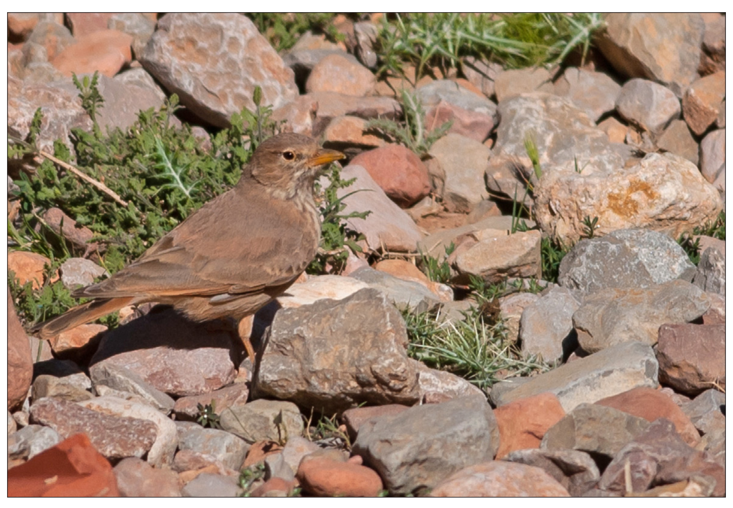
Desert Lark by Chris Poole