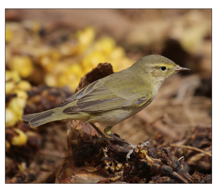
Iberian Chiffchaff by Steve Grimwade

The small irrigated fields are a migrant magnet and we found good numbers of COMMON REDSTARTS along with BLUE-CHEEKED BEE-EATERS, COMMON NIGHTINGALE, EURASIAN HOOPOES, LAUGHING DOVE, CHIFFCHAFF, WILLOW WARBLER, WESTERN BONELLI'S WARBLER, three FULVOUS BABBLERS, EURASIAN WRYNECK, TREE PIPIT, SUBALPINE WARBLER and best of all, a female BLUETHROAT!