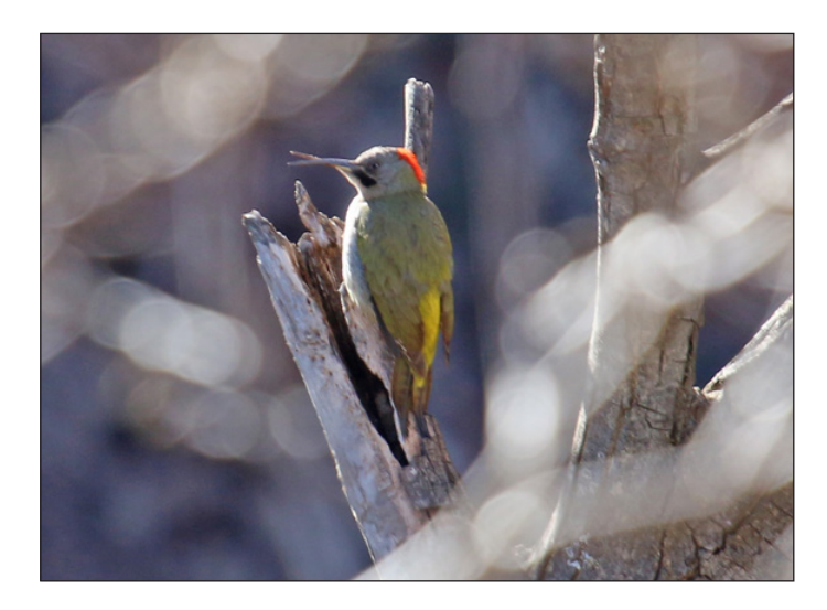
Levaillant's Woodpecker by Steve Grimwade

In a few kilometres we made another impromptu stop in a village and located one of our main targets - LEVAILLANT'S WOODPECKER! The light wasn't fantastic but we saw the bird had a deformed bill, with both upper and lower mandibles crossing and making it look more like a Crossbill!