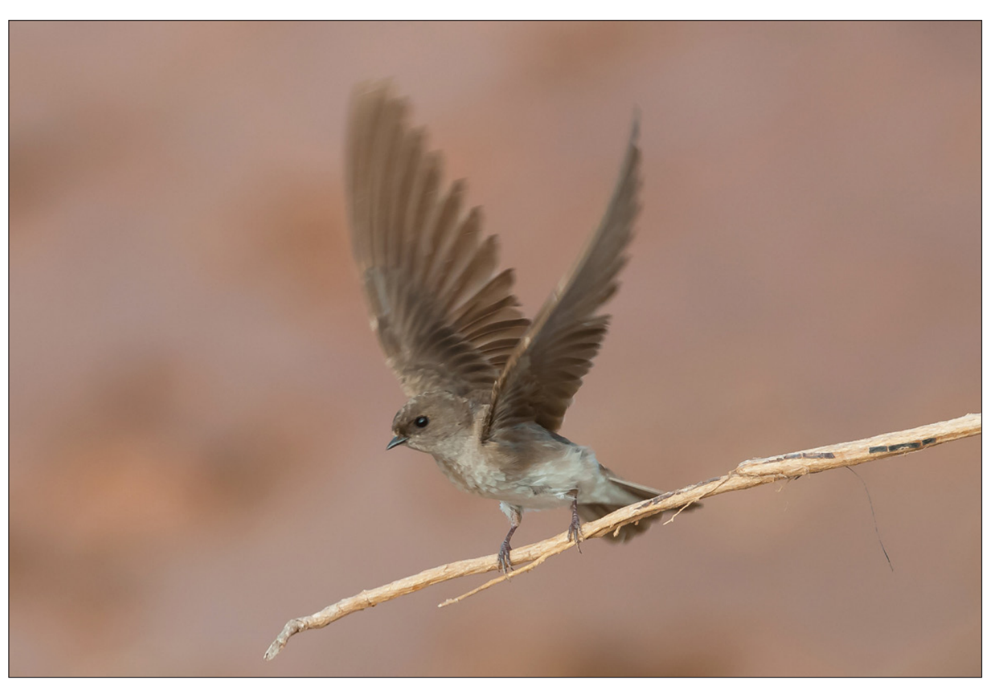
Brown-throated Martin