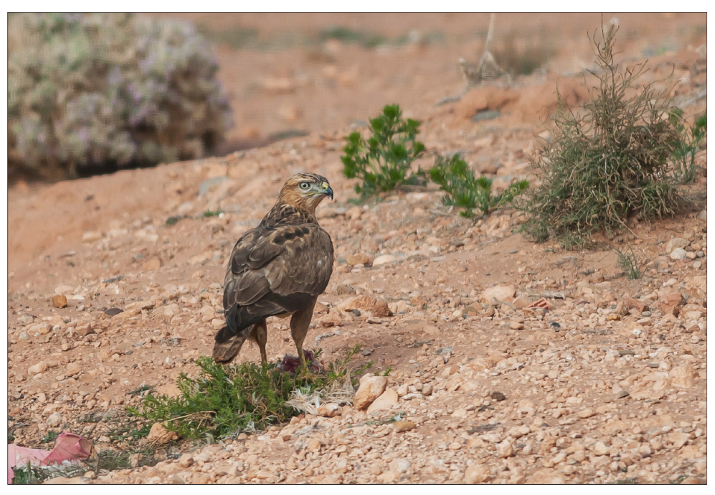
Long-legged Buzzard