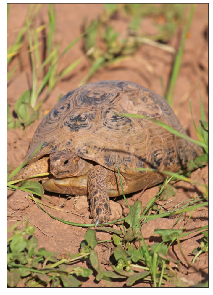
Spur-thighed Tortoise