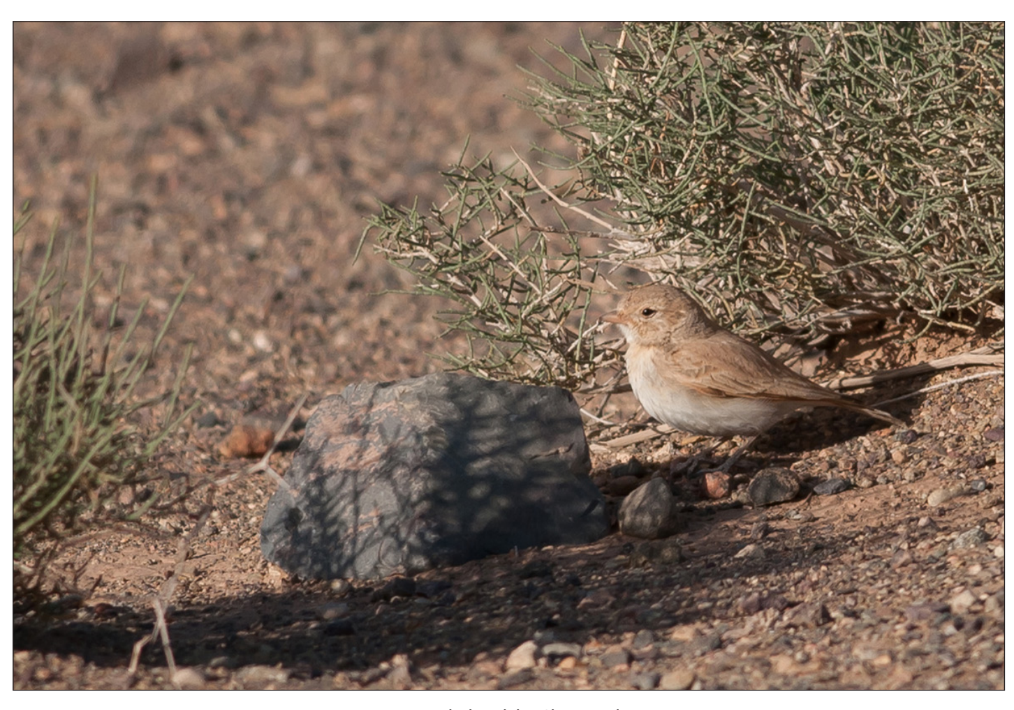
Bar-tailed Lark