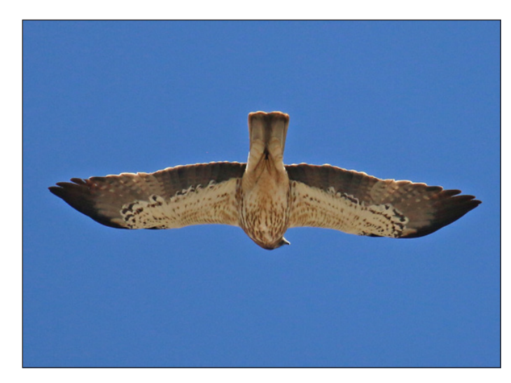
Booted Eagle by Steve Grimwade

SERIN'S and EUROPEAN GREENFINCHES frequented wooded areas and a male 'AFRICAN' CHAFFINCH gave us brief but good views. A PROVENCE HAIRSTREAK was seen briefly on the wildflower-rich slopes before we moved onwards. As we reached the edge of Toufliht Forest and took a walk along the road, we had brief views of a male NORTHERN GOSHAWK overhead. A few minutes later a EURASIAN SPARROWHAWK was seen and then we were delighted to spot three NORTHERN GOSHAWK together as they circled on a thermal.