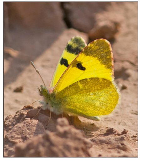
Greenish Black-tip by Chris Poole