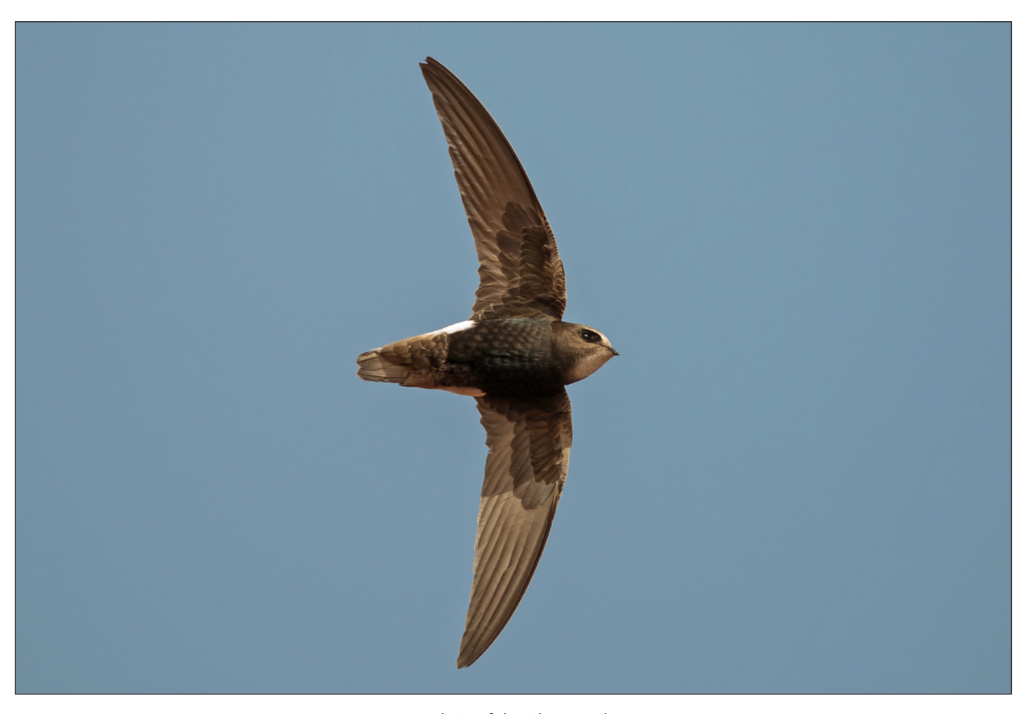
Little Swift by Chris Poole