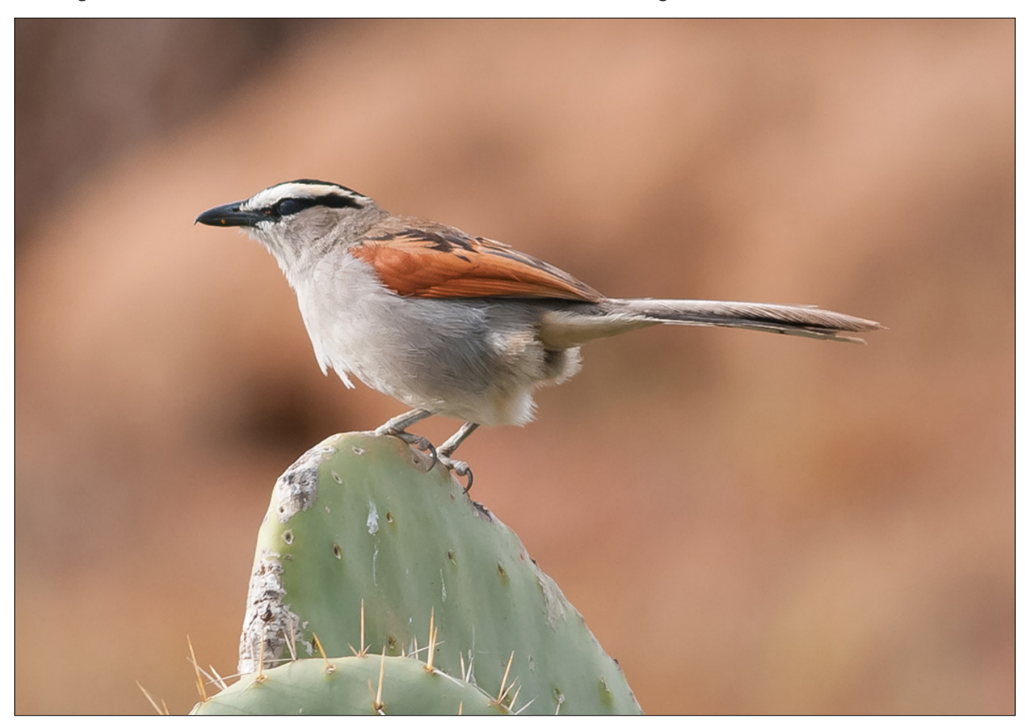
Black-crowned Tchagra by Chris Poole

Arriving at the hotel, we had time for a shower before our last evening meal of the tour.