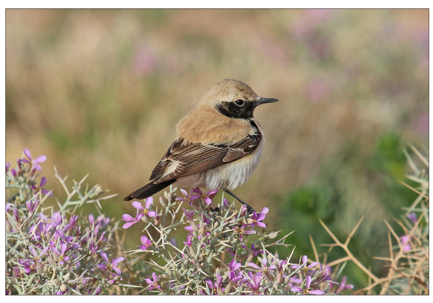
Desert Wheatear by Steve Grimwade