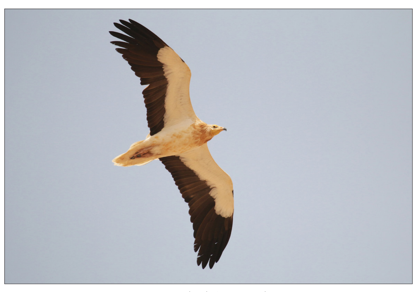
Egyptian Vulture by Steve Grimwade