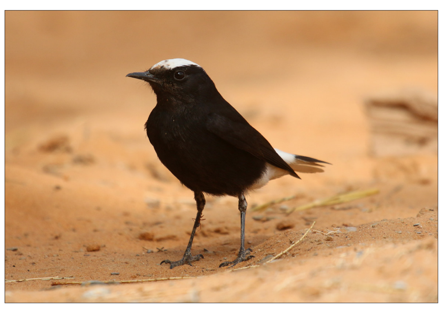
White-crowned Wheatear