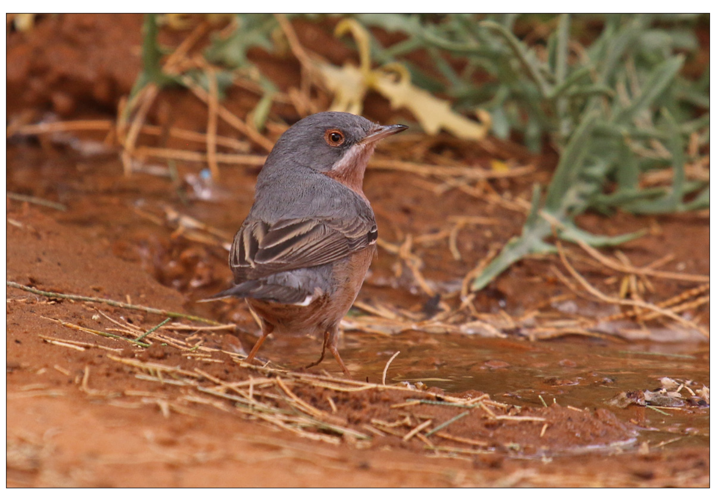
Subalpine Warbler by Steve Grimwade