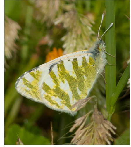
Green-striped White by Chris Poole