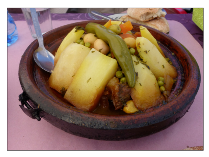
Tagine by Steve Grimwade

It was joined by a male GREAT SPOTTED WOODPECKER which showed before dropping into the river valley. The trees bordering the small fields held good numbers of AFRICAN BLUETIT, GREATTIT and ROBIN. COMMON HOUSE MARTINS flew over the houses and GREY WAGTAIL zipped overhead.