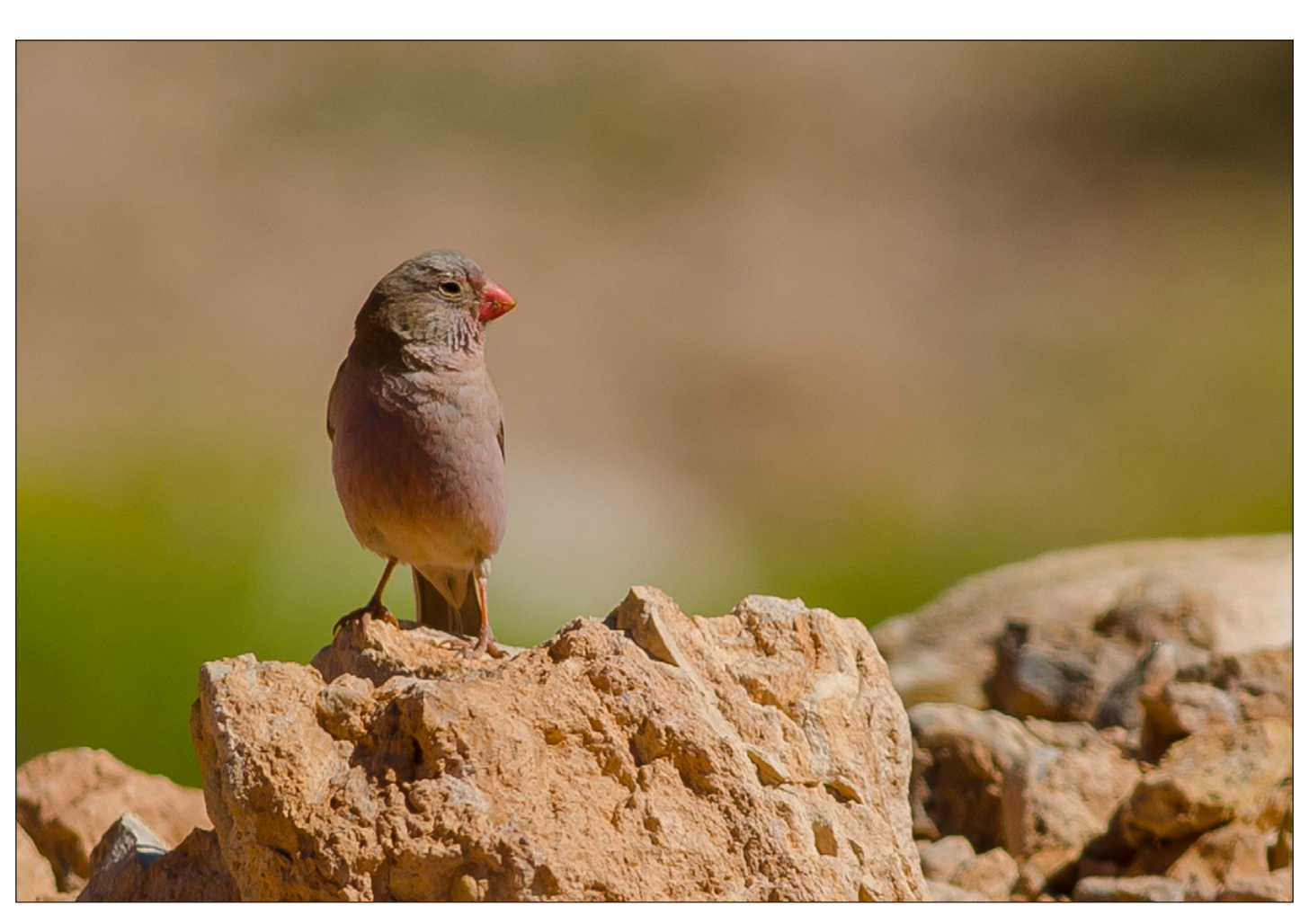
Trumpeter Finch