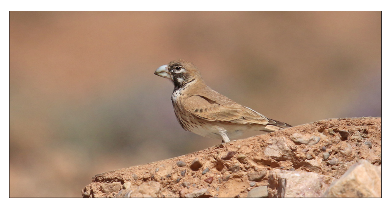
Thick-billed Lark