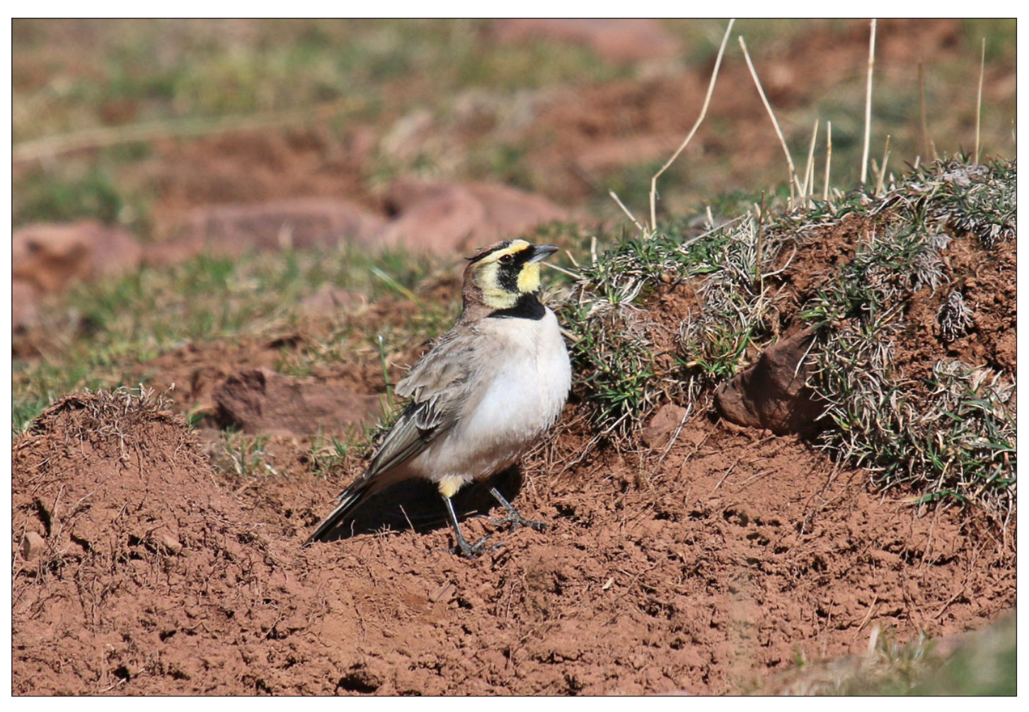
'Atlas' Horned Lark