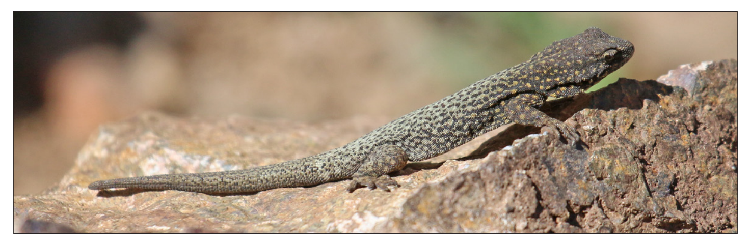
Atlas Day Gecko (female) by Steve Grimwade