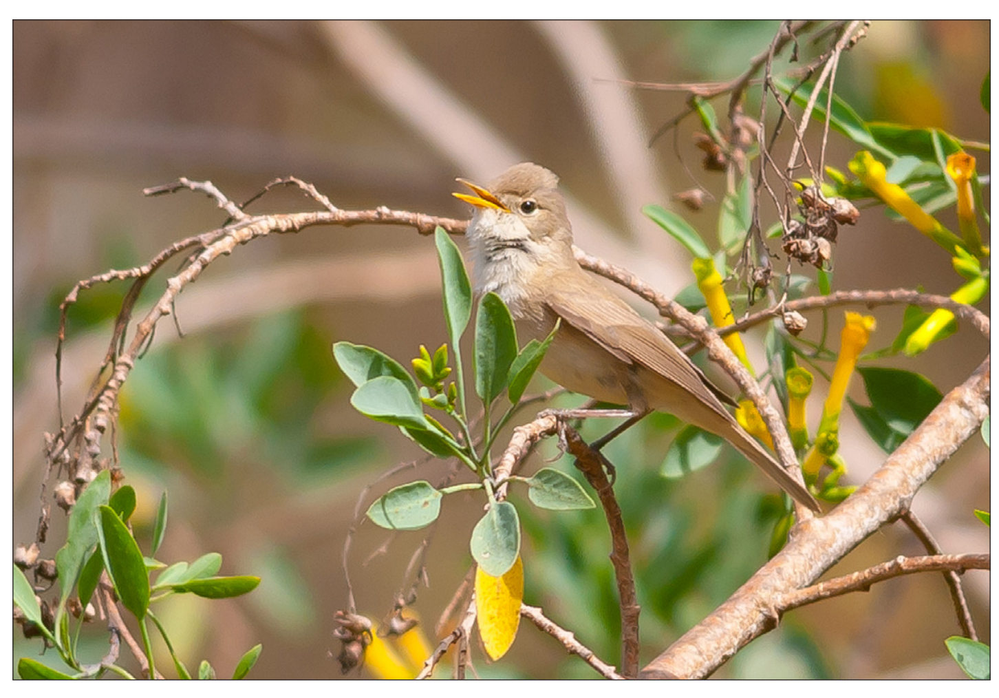
Western Olivaceous Warbler by Chris Poole