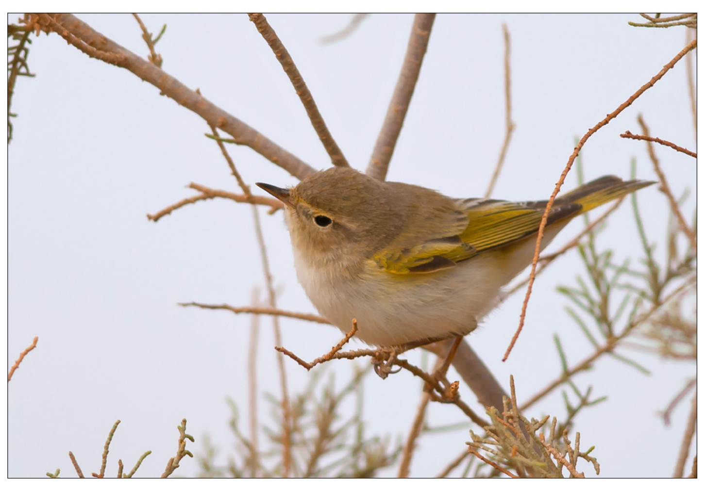
Western Bonelli's Warbler