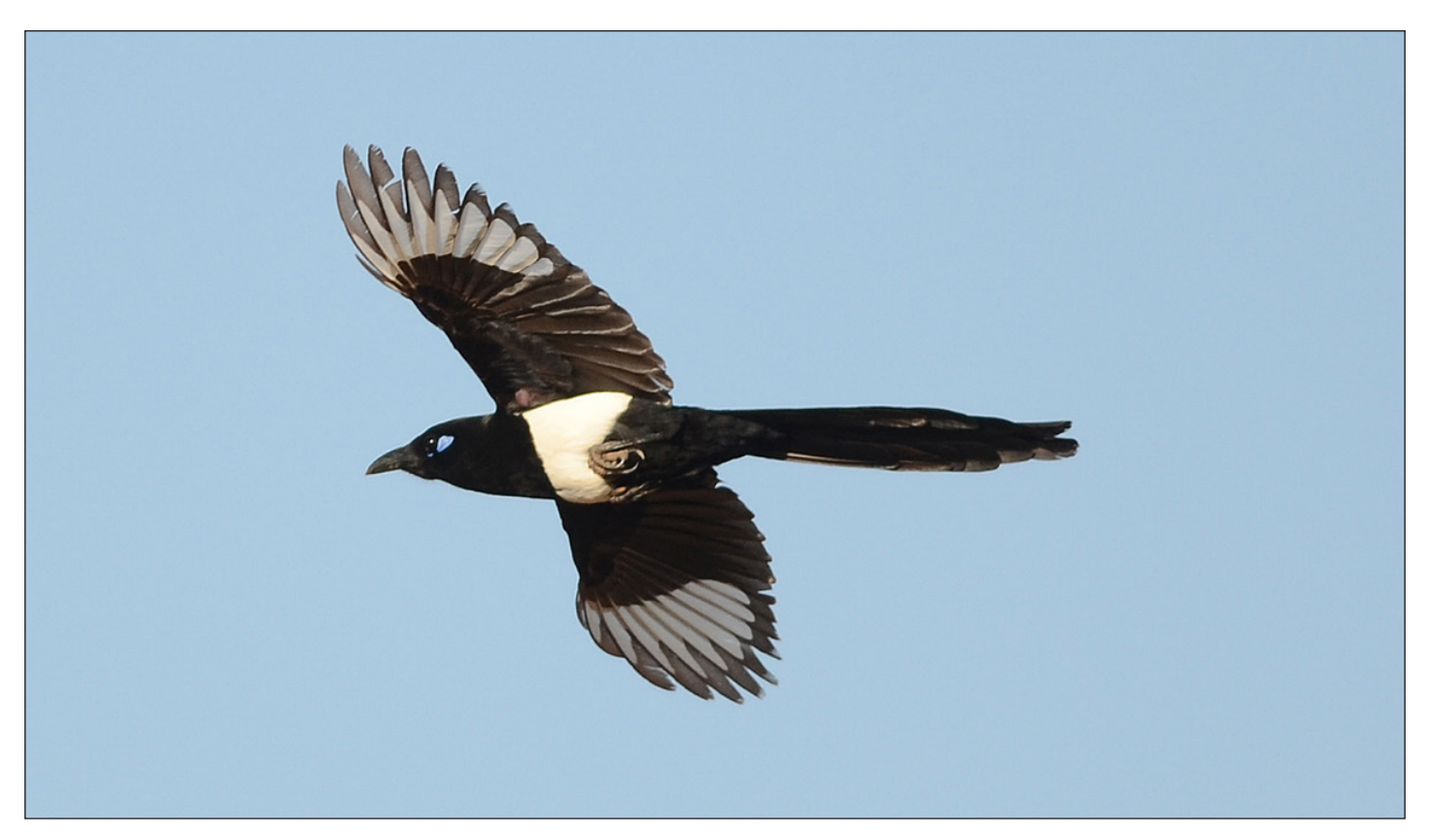
Mauritanica race Eurasian Magpie by Chris Poole

The magpies gave good views as they posed for us allowing plenty of photographs!