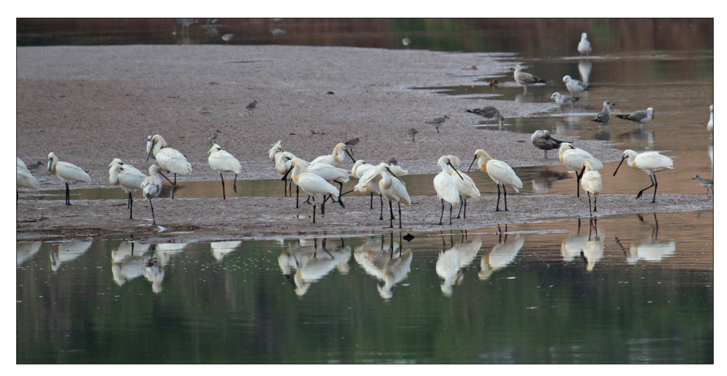
Eurasian Spoonbills

After collecting our luggage, the remainder of the group said their goodbyes after a wonderful tour to a superb country with great food, accommodation and of course, birds and company!