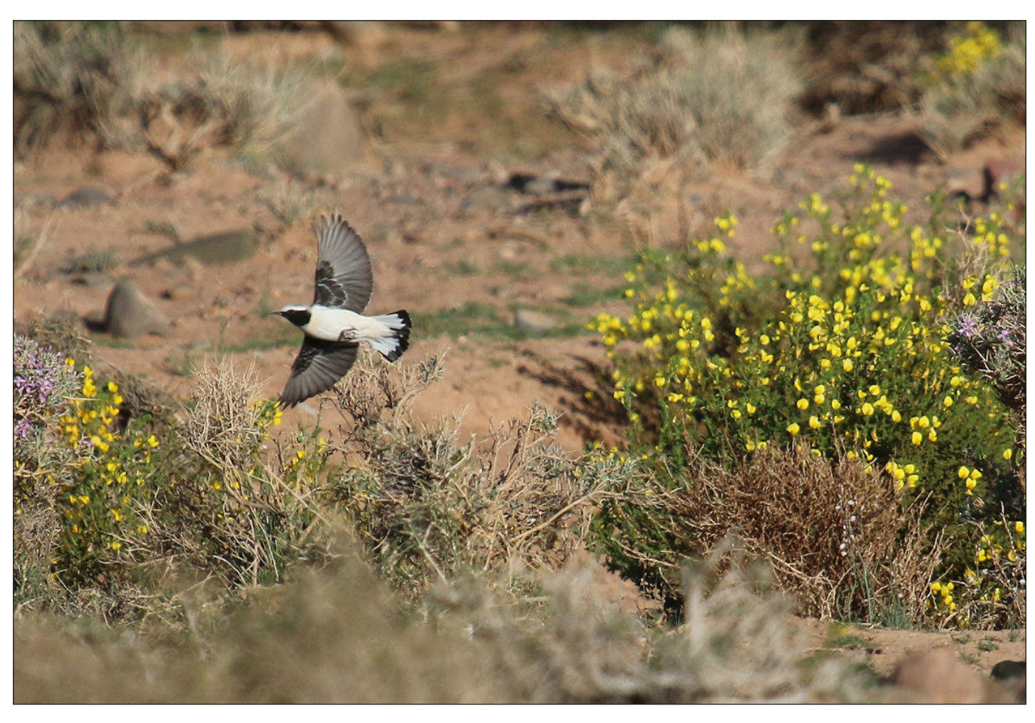
'Seebohm's' Northern Wheatear