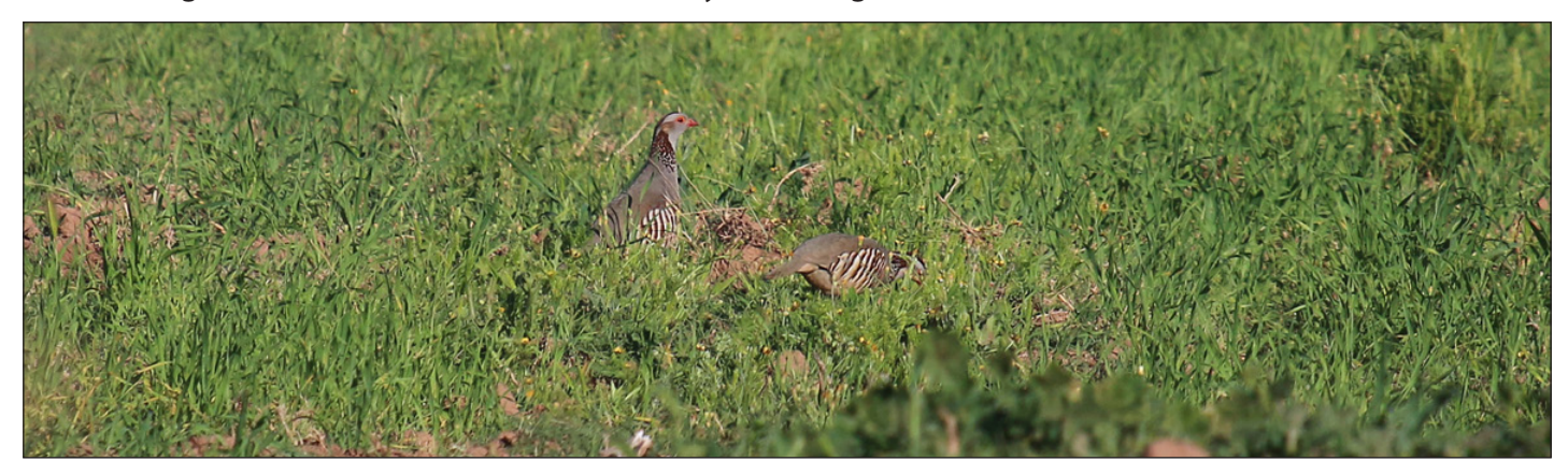
Barbary Partridges