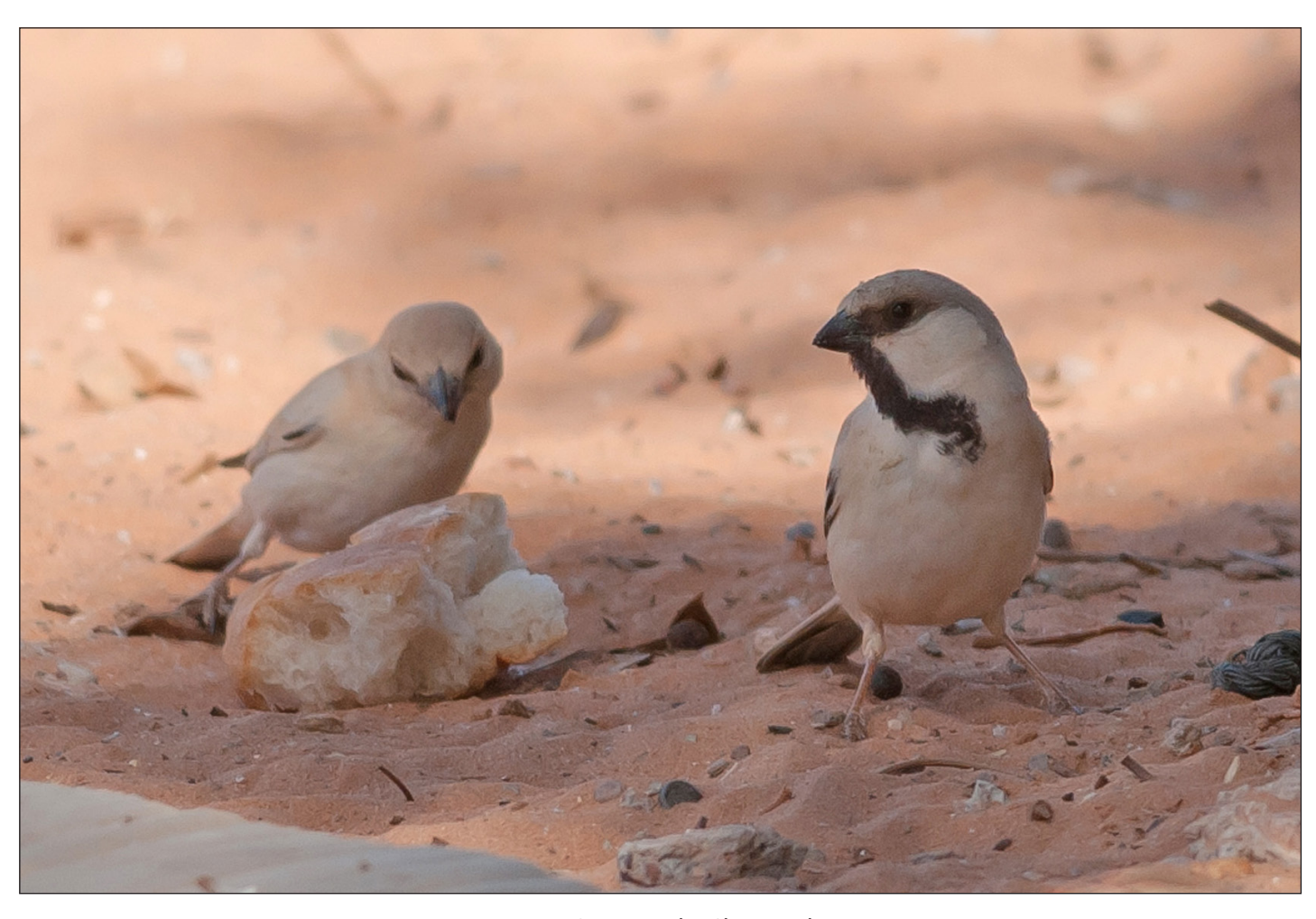
Desert Sparrows by Chris Poole