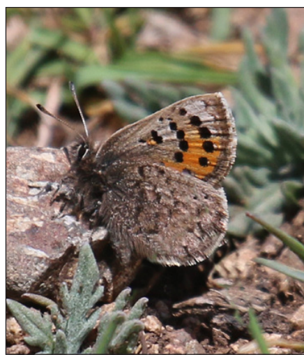
Moroccan Hairstreak