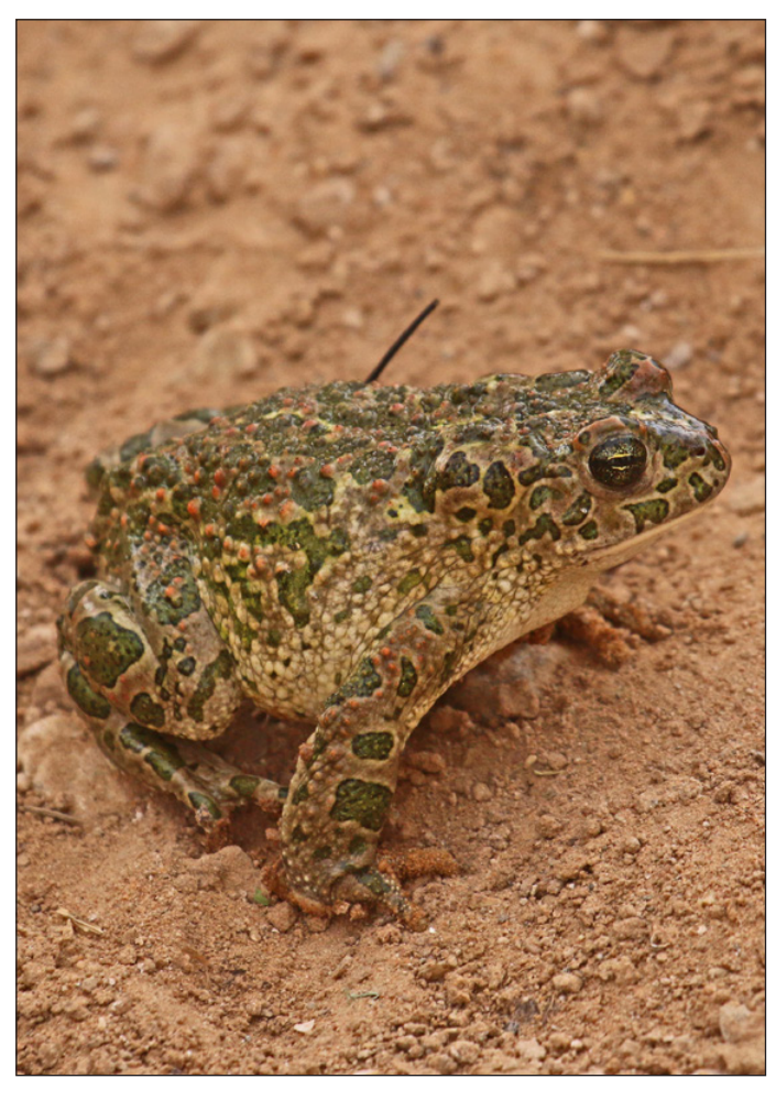
African Green Toad by Steve Grimwade