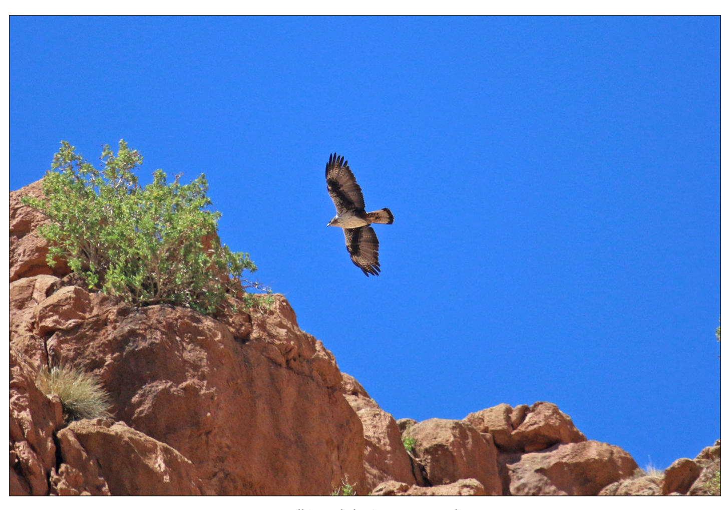
Bonelli's Eagle