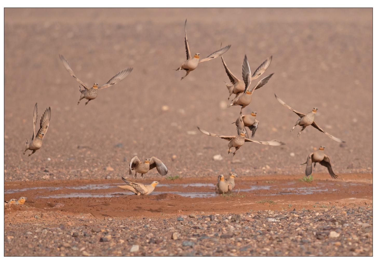
Spotted Sandgrouse by Chris Poole