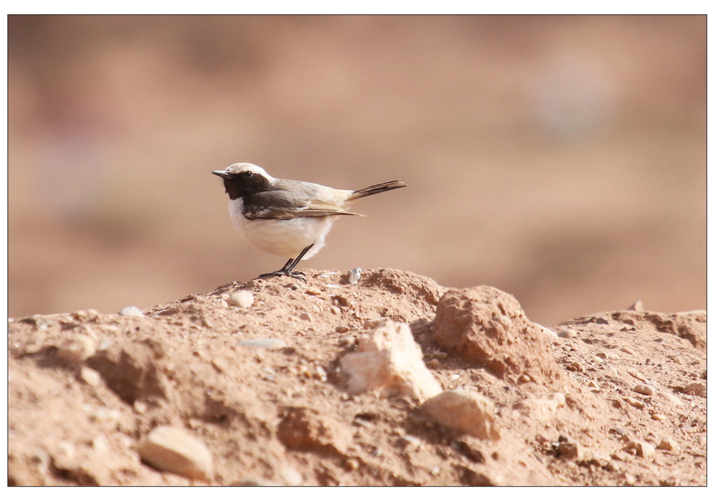
Red-rumped Wheatear by Steve Grimwade