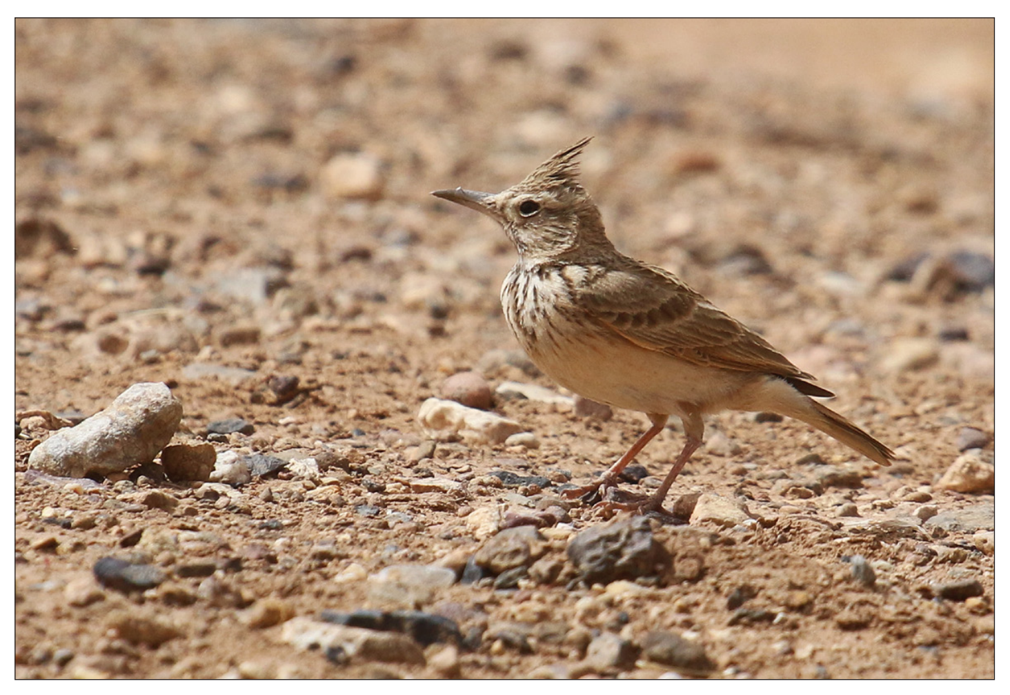
Maghreb Lark