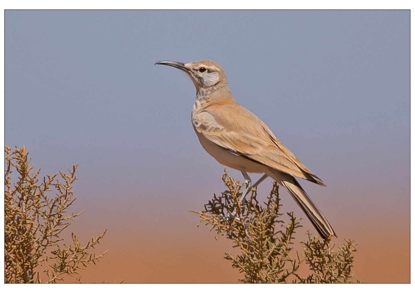
Hoopoe Lark