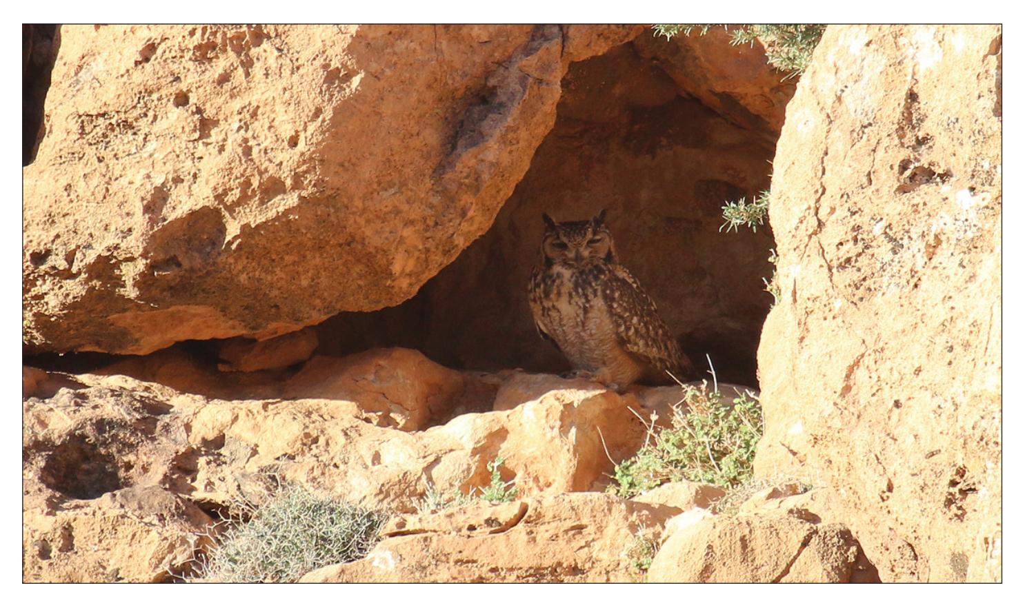
Pharoah Eagle Owl by Steve Grimwade

Our wheatear count then increased with a pair of DESERT WHEATEARS perched on top of low scrub and accompanied by SPECTACLED WARBLER. Then we another pair of DESERT WHEATEARS and a SOUTHERN GREY SHRIKE.