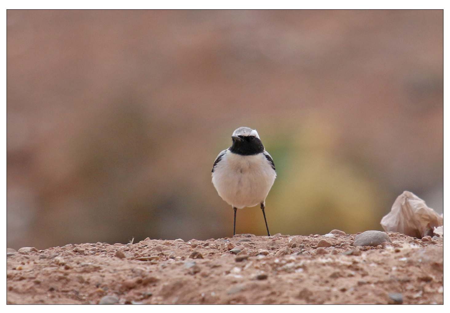
'Seebohm's' Northern Wheatear