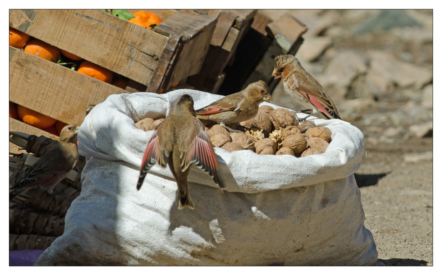
African Crimson-winged Finches by Chris Poole

Suitably refreshed, we spent time looking at both RED-BILLED and ALPINE CHOUGHS as they fed on the damp grassy pasture, occasionally taking flight and swirling above us.