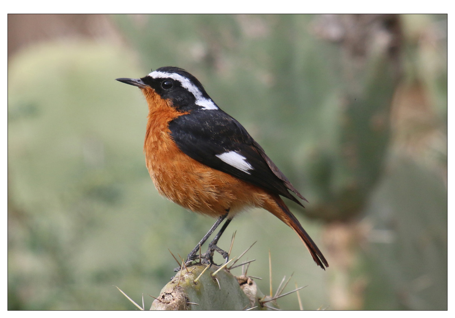
Moussier's Redstart