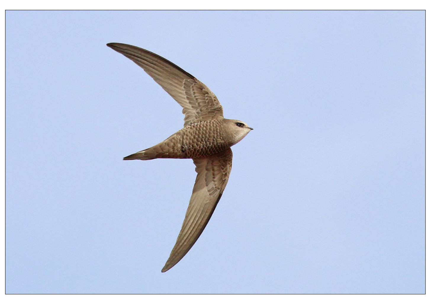
Pallid Swift