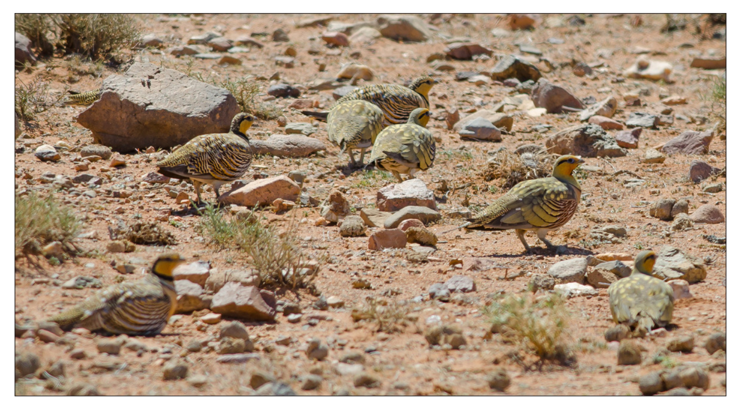
Pin-tailed Sandgrouse by Chris Poole

Breakfast was a lavish spread with so much choice that we went back several times!