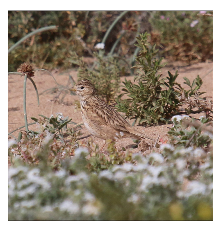
Lesser Short-toed Lark