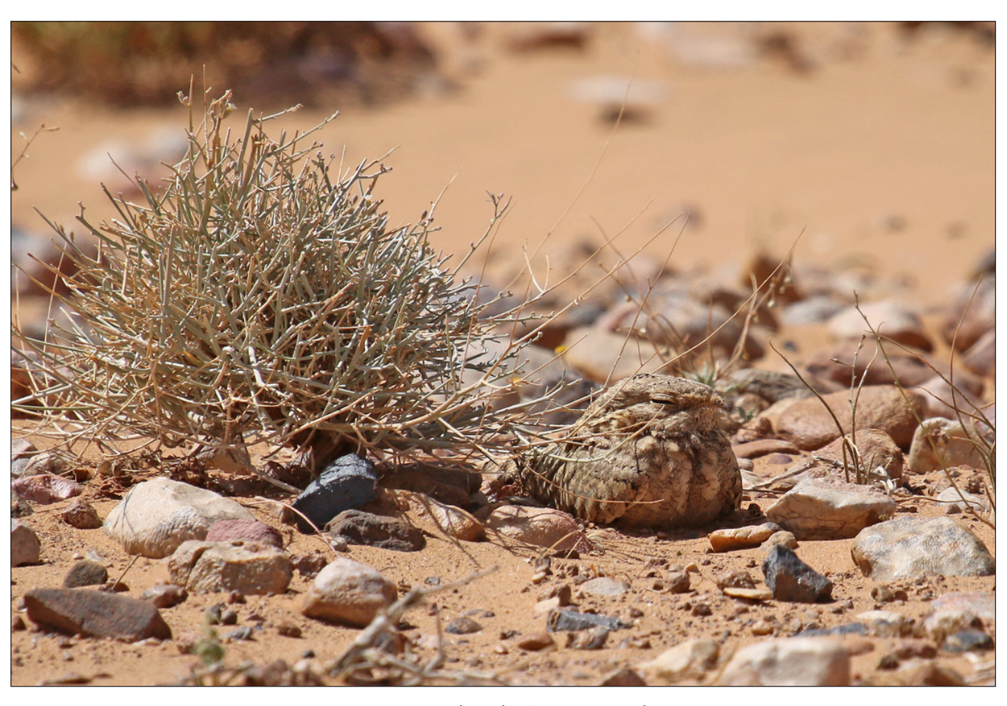
Egyptian Nightjar