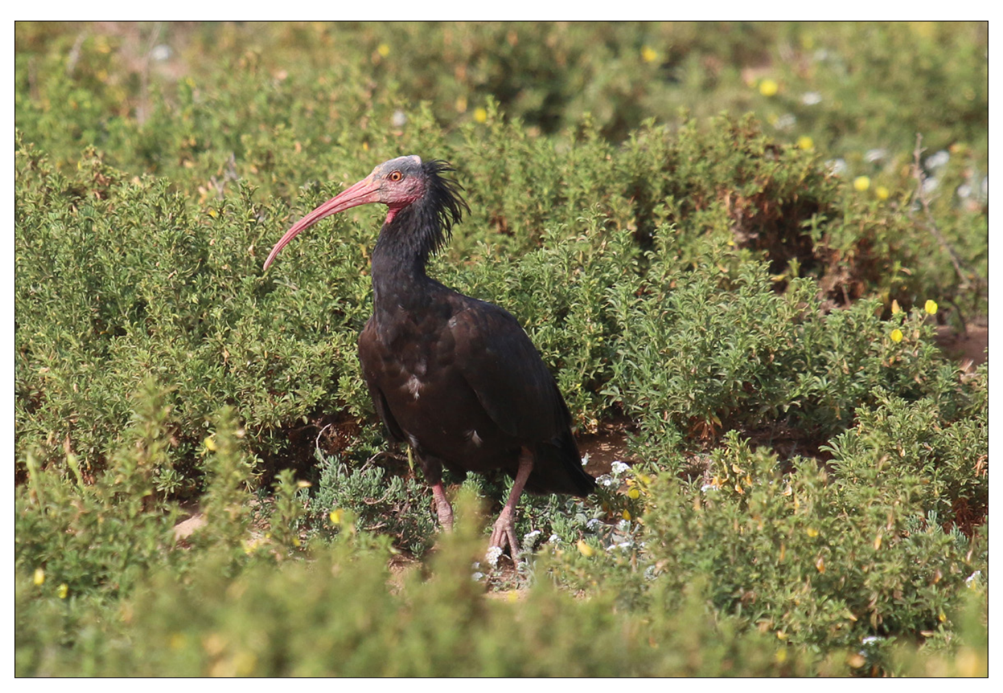
Bald Ibis