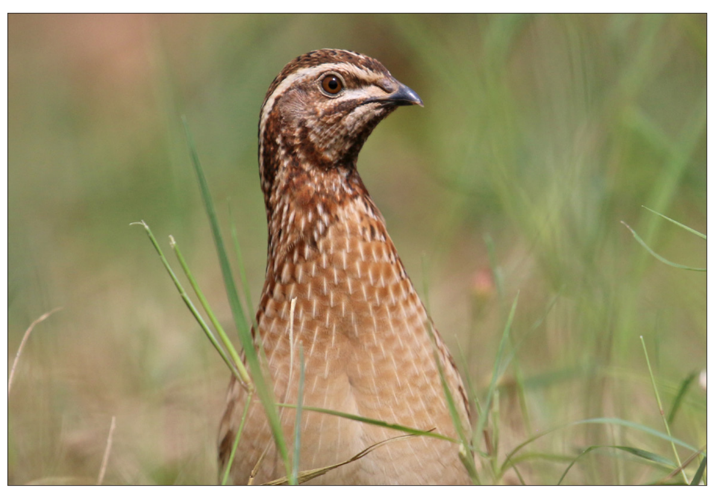
Common Quail