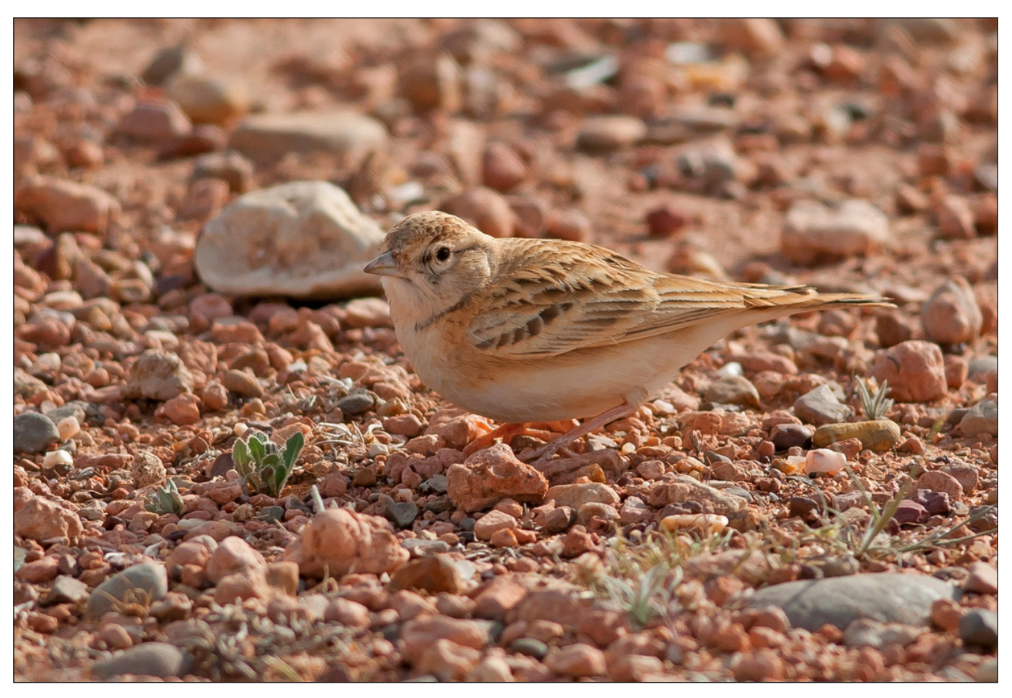
Greater Short-toed Lark by Chris Poole